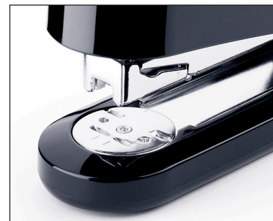
Adjustable anvil rotates for either a permanent flat clinch, temporary pin, or tack.