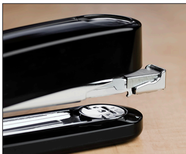
Dual staple guide system provides even pressure on the staple legs to prevent jamming.