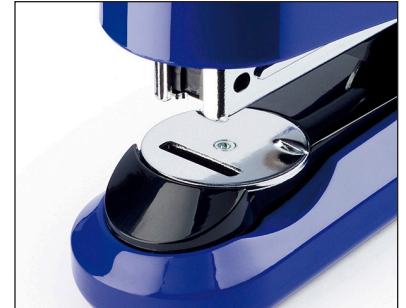
Adjustable anvil rotates for either a permanent flat clinch, temporary pin, or tack.